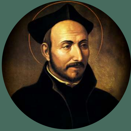
St. Ignatius of Loyola Founder of Jesuits

Society of Jesus is a Roman Catholic order of priests and brothers founded in 1540 by Ignatius of Loyola. In the vision of our founder, we seek to “find God in all things.” We dedicate ourselves to the “Greater Glory of God” and the good of all humanity. And we do so gratefully in collaboration with all who share our values. Since its origin, the Society of Jesus has been active in the field of education throughout the world.